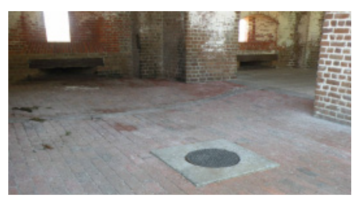
Question for students: Why didn't the soldiers drink water from the river? Answer: The fort is so close to the ocean that the river water is too salty to drink.

Walk through the casemates to the wooden railing.