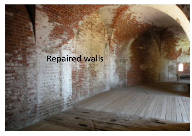
after the battle and they did not make the effort to build embrasures (windows) for the cannons.

Question for students: What's different about these walls compared to the other casemates? Answer: The Union soldiers repaired the damage