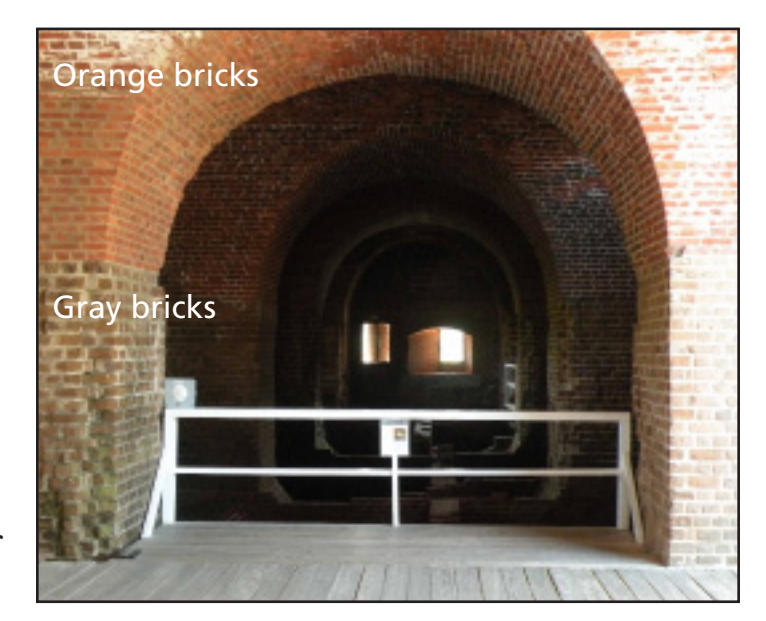
the fort was built and encourage people to help protect and take care of the historic fort.

Answer: To give people a better idea of how