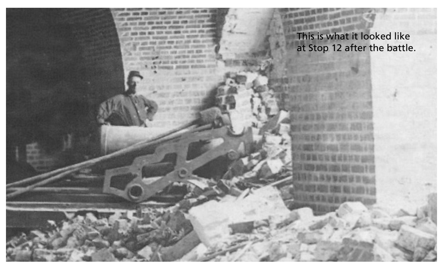
Keep walking through the casemates till you can go no further and re-enter at what would be casemate #6.